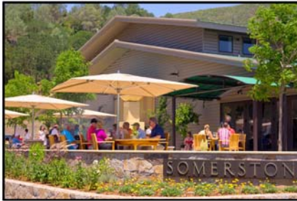
Somerston's new winery and tasting room are in a renovated barn — that has state-of-the-art, energy-efficient design.

There are still hidden places in this well-traveled county, and myriad valleys inside the “Napa Valley.” To find them takes a turn or two off the main roads, but the effort will yield unexpected rewards: glimpses of history and wildlife amid the grapes.