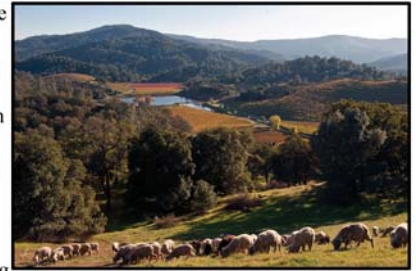
A herd of 1,500 Dorper sheep, bred in South Africa, graze on the Somerston property.

Just one more reason to turn off the main roads and find the way to Somerston.